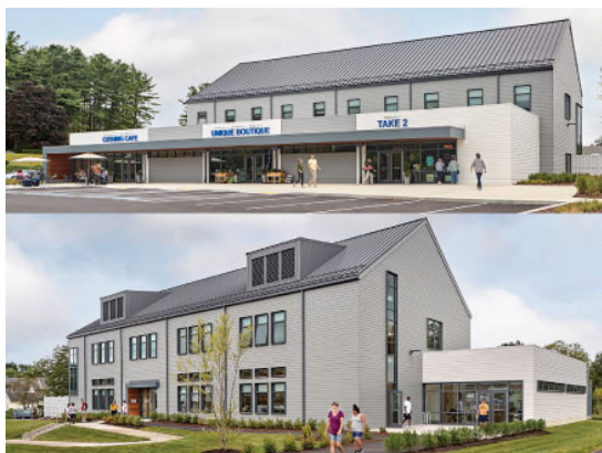
MarketPlace façade and back view