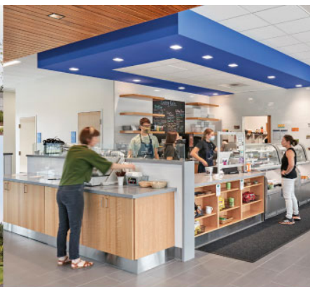
Cushing Café interior